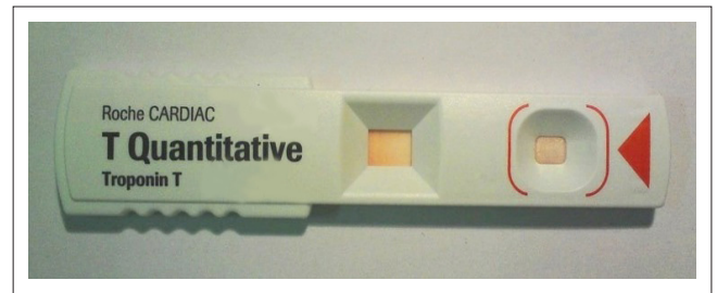
FIGURE 1: Absence of a control line on the Roche CARDIAC Troponin T Quantitative test strip.

There is increasing use of cTn measurement in the diagnosis of myocardial injury and any inaccuracy with regard to measured values is more likely to have serious clinical impact than would be the case with immunoassays for many other analytes. Several immunochemical interferences have been well described, including heterophile antibodies, 8 rheumatoid factor 9 and circulating troponin autoantibodies. 10,11 Recent studies have shown that 15.9% of samples from cohorts of normal blood donors were positive for autoantibodies to troponin T or troponin I and 10.9% were positive for both. 12 Autoantibody-antigen macrocomplexes have been well described for a number of biomarkers such as salivary amylase, 13 creatine kinase, 14 aspartate aminotransferase 15 and lactate dehydrogenase, 16 but there is no evidence to suggest that these complexes contribute to a pathological process. In contrast, cTn autoantibodies have been shown to contribute to the progression toward heart failure in mice and a similar process may occur in humans. 17 Furthermore, it has been proposed that the reduced clearance of immunoglobulin-cardiac troponin complexes from the circulation may result in increased levels of measured troponins. 18 This phenomenon does not, therefore, represent assay interference, but rather an analytically-true result, albeit misleading.